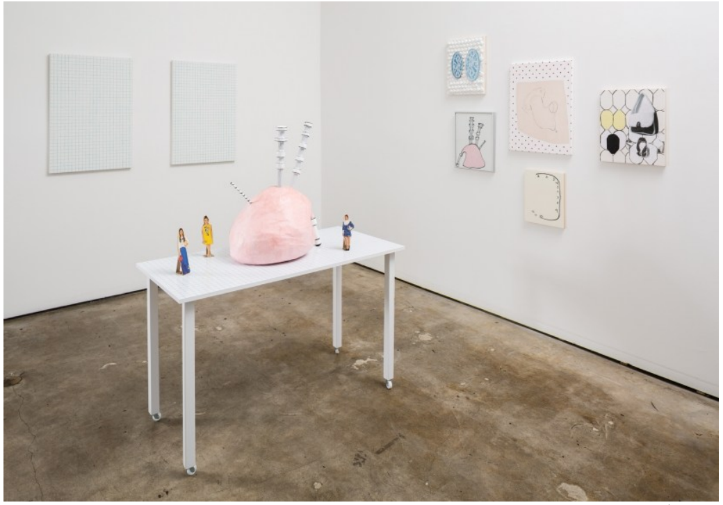
Meg Cranston, "Pizza, Bagpipe, Carburetor," Installation view, courtesy of the artist and Meliksetian | Briggs.