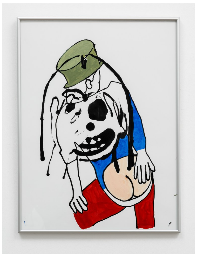
Meg Cranston, Dancer (2016), courtesy of the artist and Meliksetian | Briggs, Los Angeles.

Although the space inside Meliksetian Briggs gallery is fairly limited, Cranston's work manages to produce the sensation of being larger on the inside than the outside. The more the viewer questions the contents of the paintings and sculptures, the more one can fall into the work, and therefore the inquisitive mind of the artist. The implied sexuality within many of the works—the naked rear in Dancer , the sculpture Bagpipe (2015) resembling a scrotum with women cutouts surrounding it, the blurred face attached to a scantily clad female in Yellow Cyclone Gray (2015)—suggests Cranston's thought process when faced with language that is otherwise unprovocative. Cranston seems to be playing with the duality of what exists and what doesn't through words and the intuitive searching around in the dark for the associative