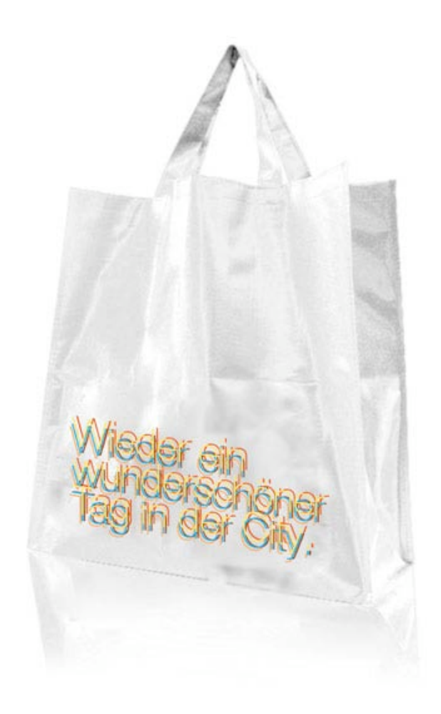
Liam Gillick, Another Fine Day in the City (prototype), 2009.

JM It sounds like a deliberately toned-down version of "Today is the first day of the rest of your life." On the face of it, it is very upbeat, but when you start thinking about it, it is almost a condemnation.