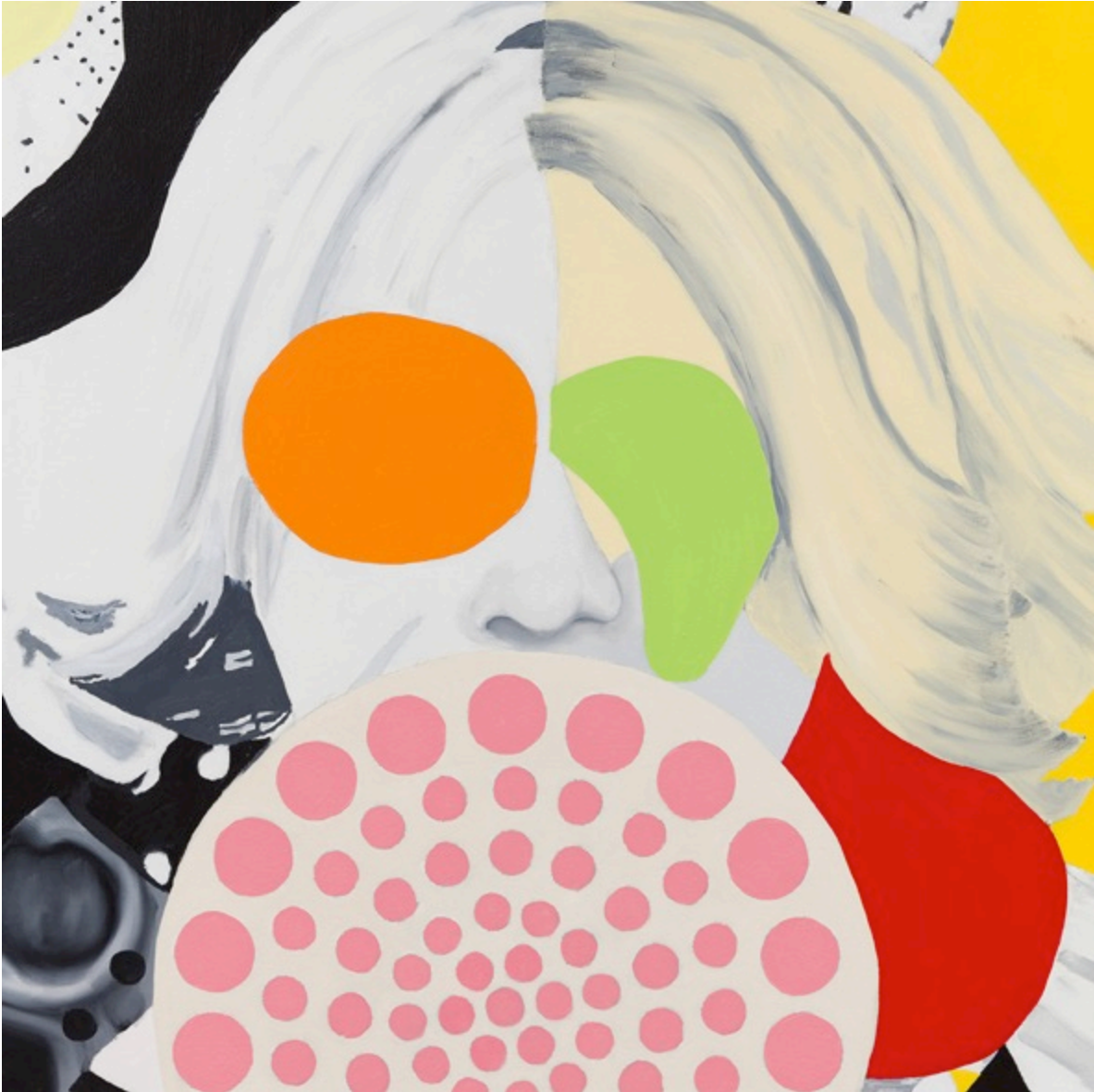
Detail: Meg Cranston, Myth of Symmetry II , 2013 / 2019.